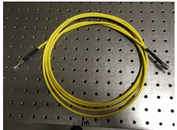
PMC Patchcord with FC connectors

The PMC Patchcord is your ideal partner for nonlinear imaging, OCT, distortion-free ultrafast laser fiber delivery, sensors, spectroscopy