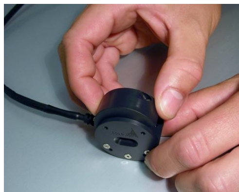
Figure 3. Oven top replacement

When replacing the oven top, check that the recess for the cable is on the correct side. It must also be ensured that the spring pins, which push the clip onto the heater, locate properly and will not be damaged as the top is pushed on. As the oven top is relocated gently push down towards the heater and tighten the retaining bolts (shown in figure 3). Do not use excessive force to tighten the retaining bolts , otherwise thread damage may occur making it impossible to fasten the oven top.