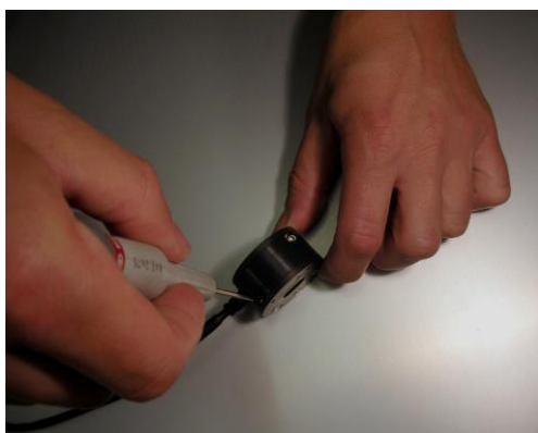
Figure 1. Oven top removal

Covesion's PPLN oven is designed for optimum operation of PPLN crystals at elevated temperatures, and also offers a convenient and accurate method of mounting and aligning optical crystals within an optical train.