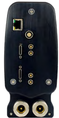
SWaP : H175 x W76 x L242.4 mm, 4.2 kg, up to 90 W typical with cooling